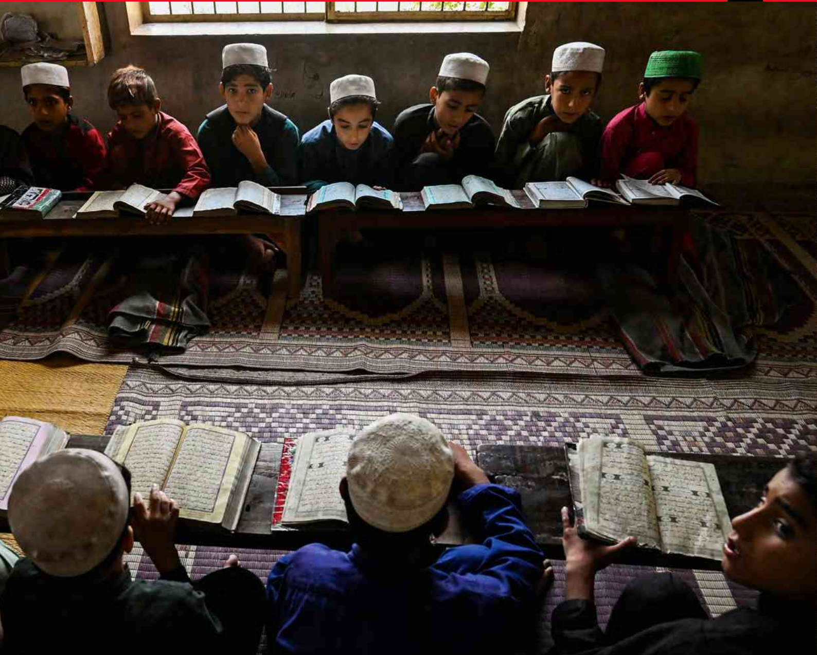
Afghan refugees offer Eid al-Adha prayers at a mosque near Peshawar on July 9, 2022. An estimated 3.7 million Afghans fled to Pakistan in the wake of the Taliban's ascension in August 2021, of which over 500 are confirmed journalists.

inordinate delays in granting of US visas. The protest was prompted by the stalling of the US government's Priority 1 and Priority 2, known as P1 and P2 refugee programs to fast-track relocation of "at-risk" Afghans, including journalists and rights activists facing persecution from the Taliban. Eligibility criteria included: previous work for the US government, a US-based media organisation or NGO in Afghanistan, and a referral by a US-based employer.