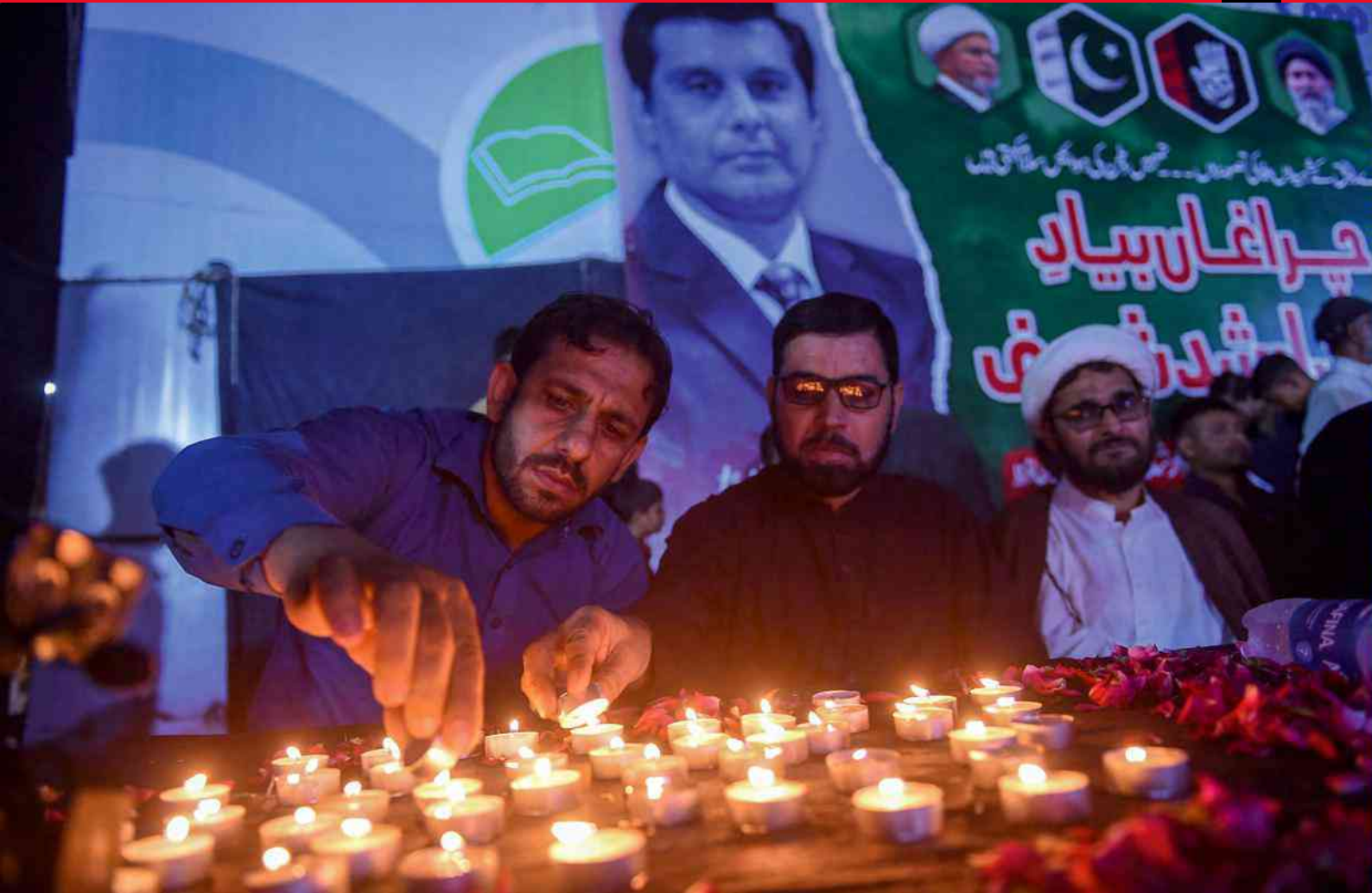
Members of the Shiite Uleme Council light candles in a memorial for slain journalist Arshad Sharif on October 29, 2022. Discourse and investigations into Arshad Sharif's October killing have been marred by misinformation, diplomatic failings, and impunity.

FMM said they faced safety and security issues during their work. Significantly, 71 per cent of them said that they were not satisfied with the way their media institution had intervened in such issues.