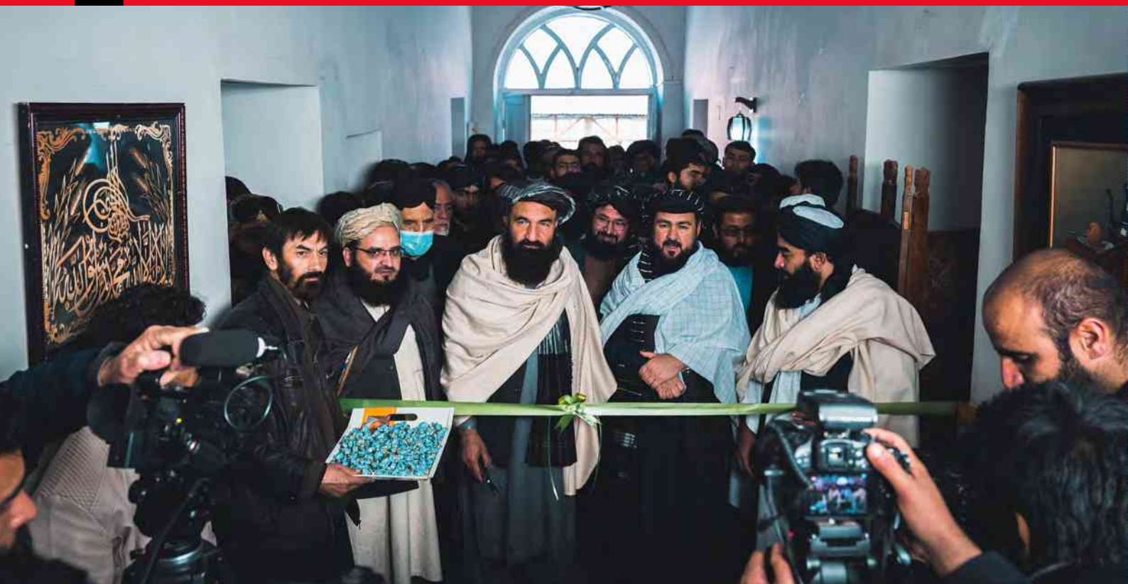
The head of the Taliban's Ministry of Information and Culture attends an opening ceremony for a museum on February 24, 2023. With the Taliban solidifying control over Afghanistan, the country's media professionals face turmoil and desperation.

in violations against the media. The booking of a journalist under the blasphemy law for allegedly defaming Islam by reporting remarks ascribed to former prime minister Imran Khan saw widespread condemnation by journalists' unions and civil rights groups. In February 2023, the president of Digital Media Alliance Pakistan (DigiMAP), faced death threats and was hounded on Twitter for defending the rights of religious minorities and law enforcement agencies arrested and charged 62 social media users with posting 'blasphemous' material and propagating alleged hate speech.